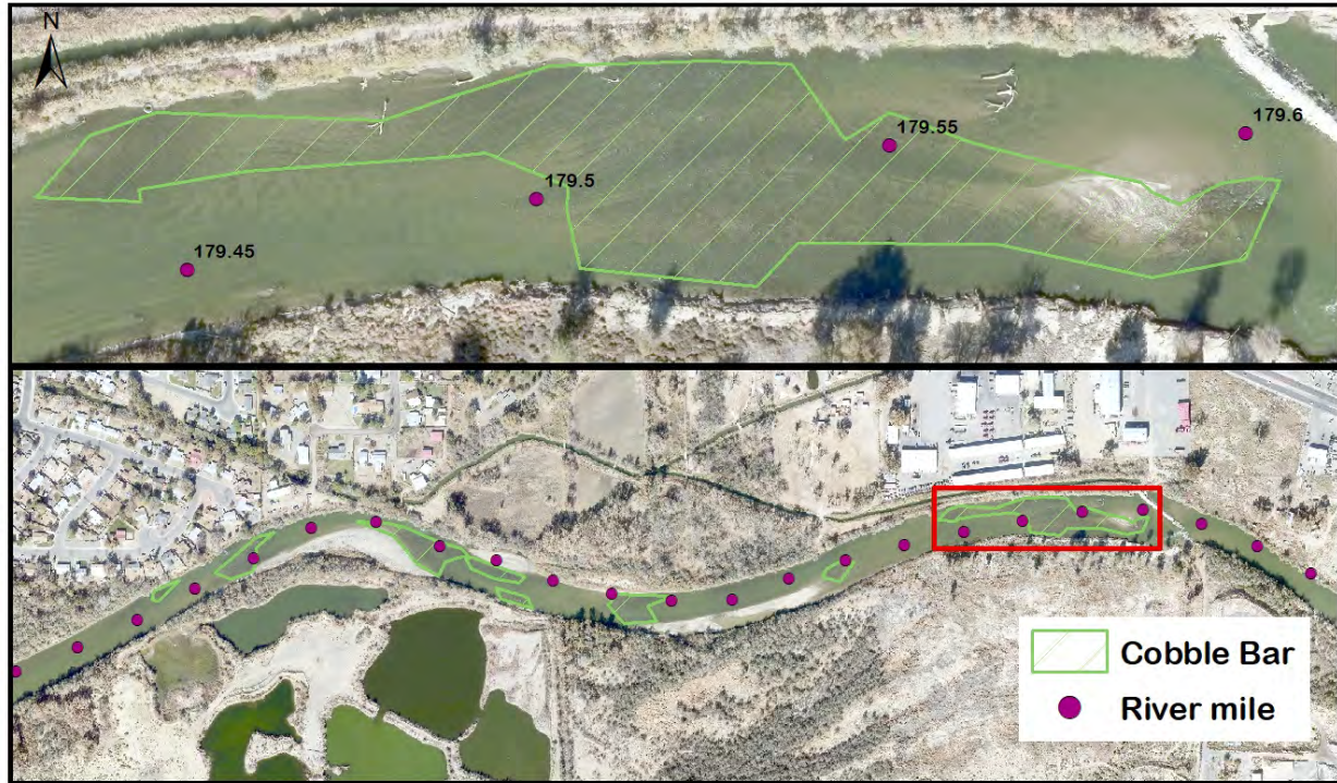
Figure 2. Example of 2019 aerial imagery showing submerged cobble.

Because the Public Service Company of New Mexico (PNM) fish passage facility is included in the lower portion of the study area there will be a record of fish detected below and successfully passed upstream of the diversion into the upstream study area. Detections at PNM will be used to evaluate the ability of successive PITPASS surveys to detect known live fish within the study area. To evaluate fish leaving the study area, we will deploy PIAs at the mouth of Animas River confluence in areas where fish would likely be detected (e.g., eddy near the thalweg).