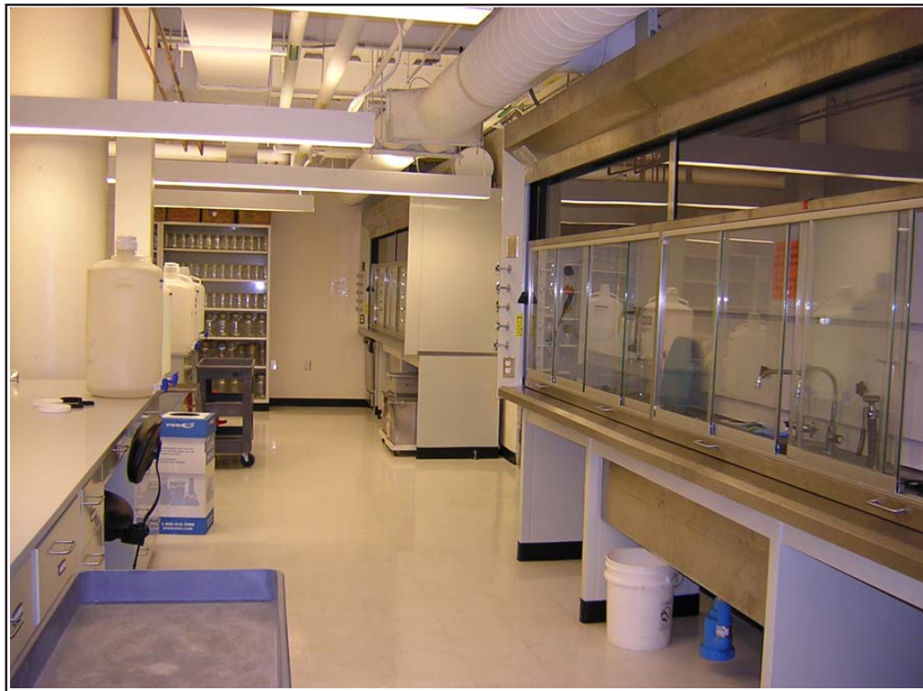
Figure 3. Specimen preparation lab (fume hoods along the west wall)