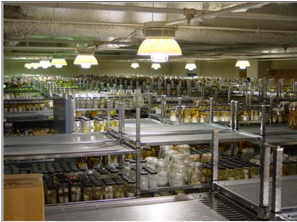
Figure 1. MSB fluid preserved collection, Division of Fishes