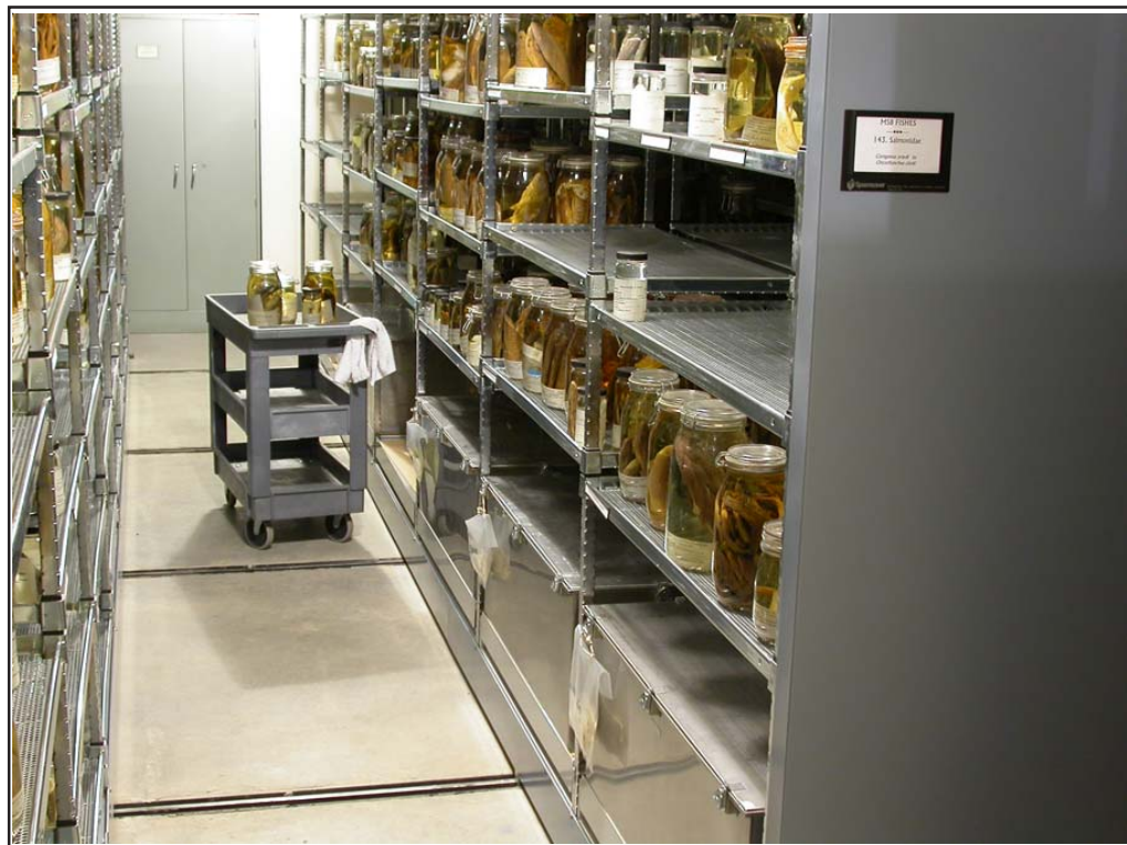
Figure 2. Compactor storage shelves with jar and tank collections