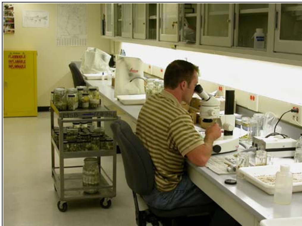
Figure 4. Lab space used for fish identification.